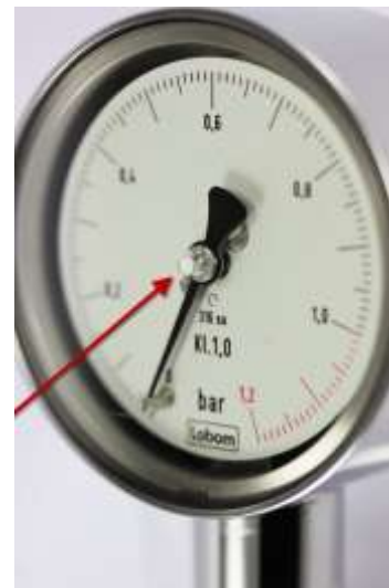
Figure 3: Vent element in the front glass

No activity is necessary prior to commissioning with ventilation systems positioned in the front glass, like for type series BH8xxx (Figure 3). Avoid contaminating the vent element.