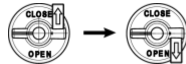
Figure 2: Move valve

The devices are supplied with a closed vent valve (CLOSED position). Moving the red lever to the OPEN position equalises the pressure level inside and outside the case (Figure 2).