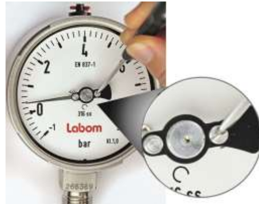
Figure 4: Zero-point correction

You can find further information about zero-adjustment of pressure gauge with micro adjustment pointer in the document TA_029 on www.labom.com .